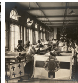
RSN Workroom c.1903