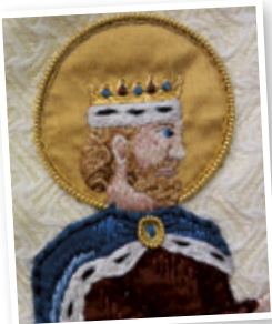
Inset: Game of Thrones detail

“Having presented the Royal School of Needlework with something of a challenge to create a suite of vestments to mark the Millennium of Buckfast Abbey, it was an enlightening experience to be able to work with a team whose skills are of such a high order of excellence.”