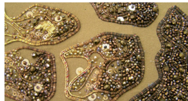
Work in progress of 'Red Carpet Green Dress' worn to the Oscars