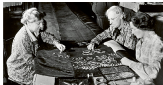
Working on The Queen's Coronation Robe

The Royal School of Needlework has an exceptionally rich history. Here is a selection of just some of the many memorable projects showcasing our Embroidery Studio's unparalleled experience in the art of hand embroidery.