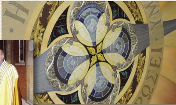
All Seasons altar frontal for Canterbury Cathedral