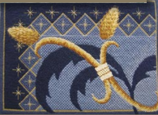
Kneeler - design commissioned for The Clothworkers' Company church