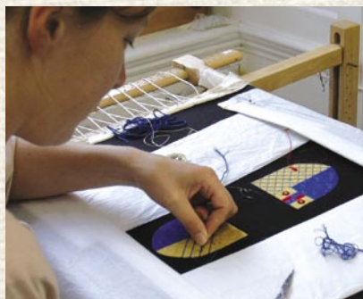
Replacement sleeve badges embroidered in silk and metal threads