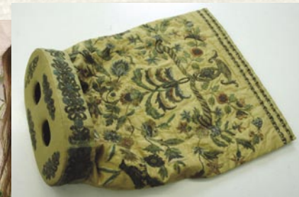
Conserved Torah cover using specifically dyed conservation net