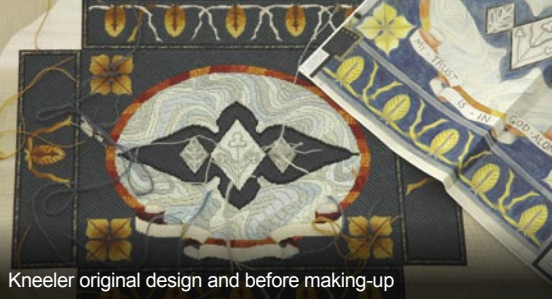
Kneeler original design and before making-up

“...under expert tuition and encouragement I rapidly made strides in mastering the technique.”