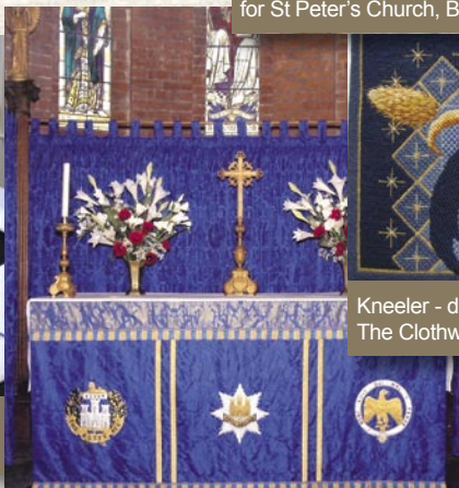
Embroidered altar frontal worked in metal threads and silk for The Royal Anglian Regiment and The Essex Regiment Chapel