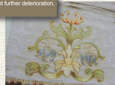
Pulpit fall before repair showing loose threads and missing stitches

It is only right that textiles in places of worship are used but this also means that they can get worn and damaged. Working with specialist conservators for cleaning, we can repair, protect, and even recreate historic, much loved pieces. For example, we can transfer existing designs onto replacement background fabric or, by using netting, prevent further damage to delicate areas.