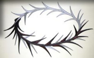
Lent altar frontal (reverse of All Seasons frontal)