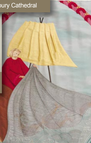
Church banner using contemporary and traditional embroidery techniques, designed for St Peter's Church, Bournemouth