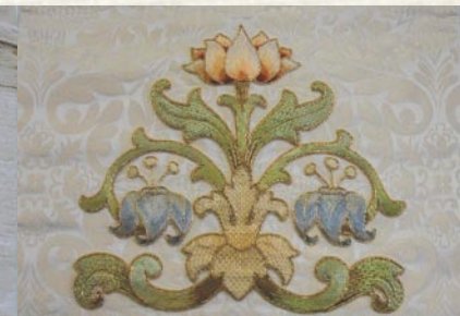
Pulpit fall following repair, transferred onto new damask

The RSN Studio has worked on pieces for cathedrals, parish churches, synagogues, mosques and a range of public, private, military and community organisations.