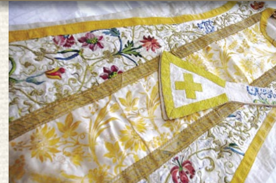
Antique vestments, supported and surface-couched onto silk, and then netted and relined for display purposes