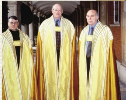
Copes commissioned for Wells Cathedral