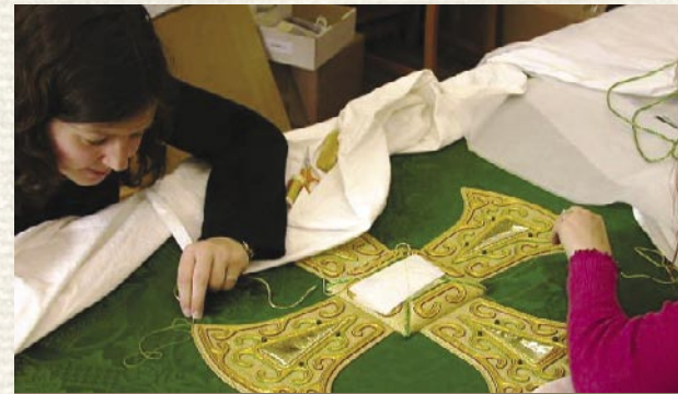
Applying metal thread embroidery to a new altar frontal